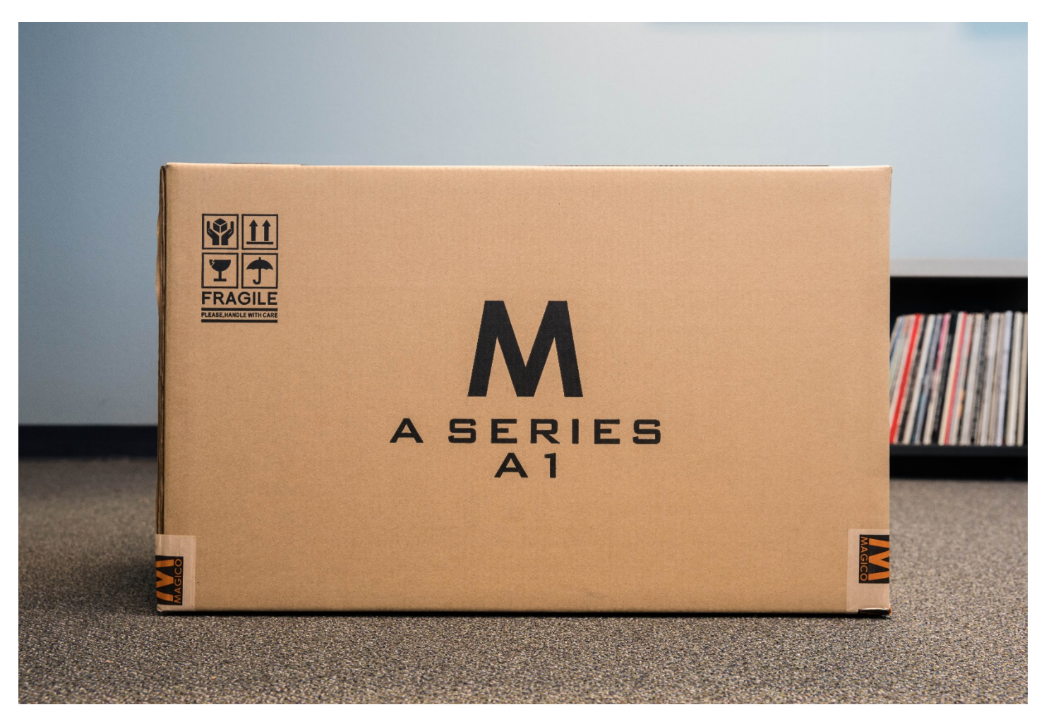
1. CUT TAPE AND OPEN BOX. WITH TWO POEPLE LIFT THE FIRST SPEAKER WITH ITS FOAM CAPS FROM THE BOX